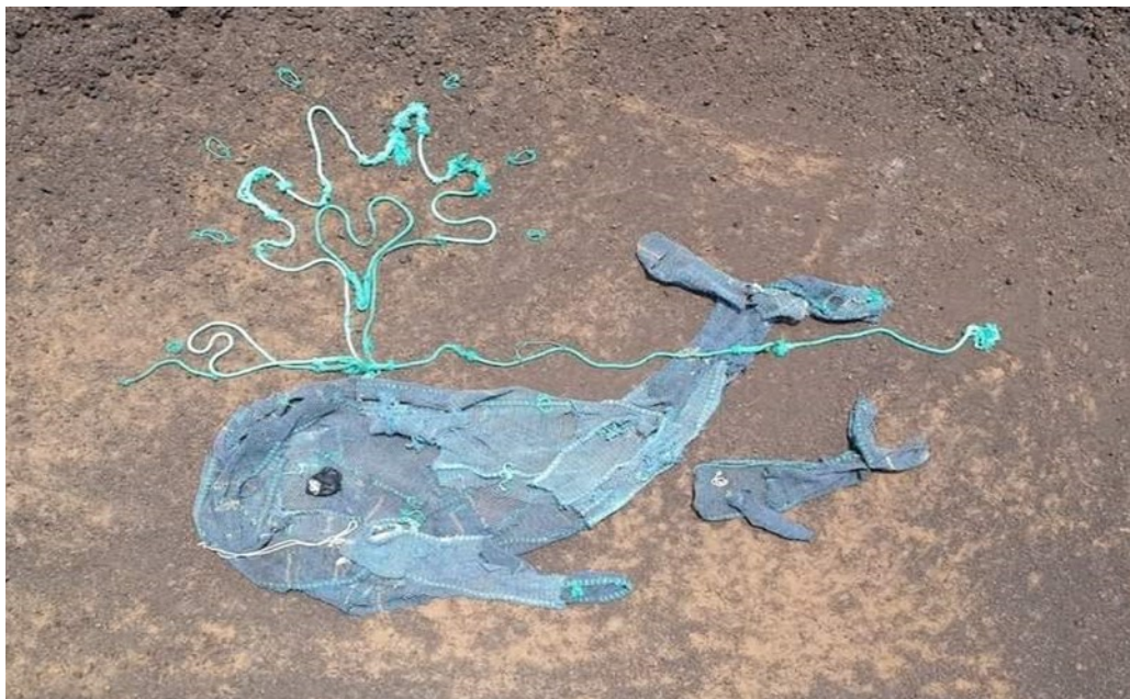
Using the net, we created this aerial image of a whale and calf - hopefully all our marine life is a little bit safer now that this threat has been removed from our shore.

If you are interested in more information about ghost gear, consider reading the 2019 Greenpeace report on ghost fishing available free online https://www.greenpeace.org/international/publication/25438/ghost-gear/